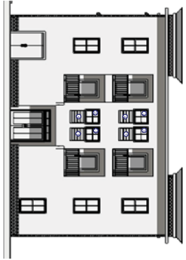
REAR ELEVATION 1/8 in = 1 ft