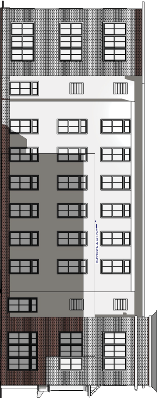
LEFT SIDE ELEVATION 1/4 in = 1 ft